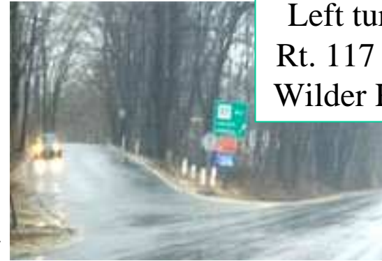
Left turn – Rt. 117 onto Wilder Road